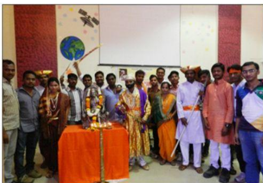
Inauguration of Shivjayanti by student