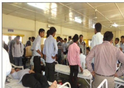
Students donate the blood