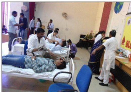
Student doing the blood donation