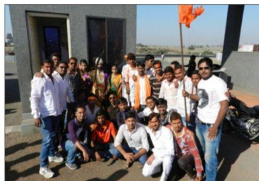
Students presents for Event