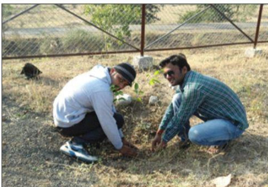
Plantation of tree by student of NSS at manjarsumba village