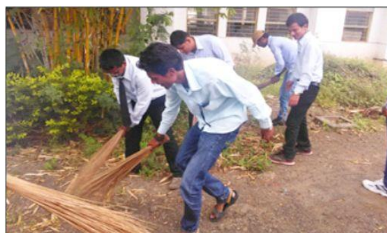
Cleaning of College campus by NSS Students