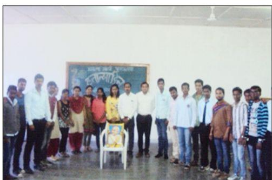
Students present for Event