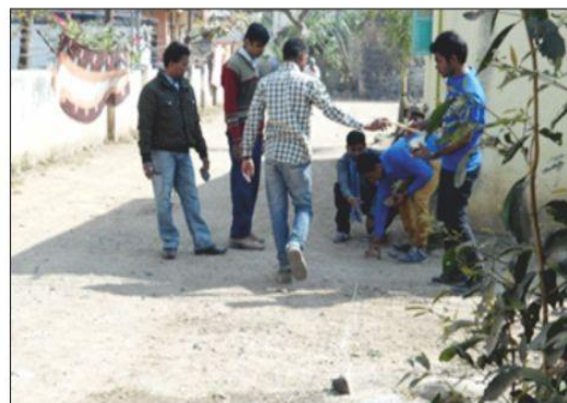
Lay Outs and marking of internal roads