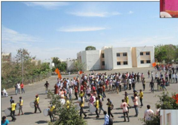
Rally by Students