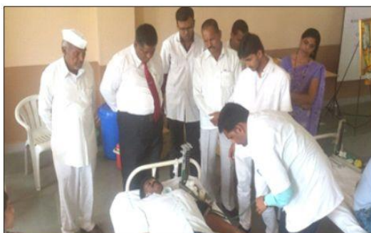
Students donating blood during the camp