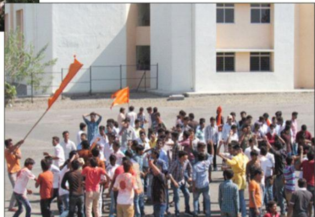
Rally by Students