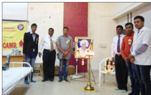
Inauguration of the Event