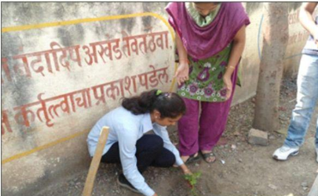
Tree plantation at Jakhangaoon by students