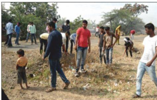
Cleaning of village during the camp by NSS students