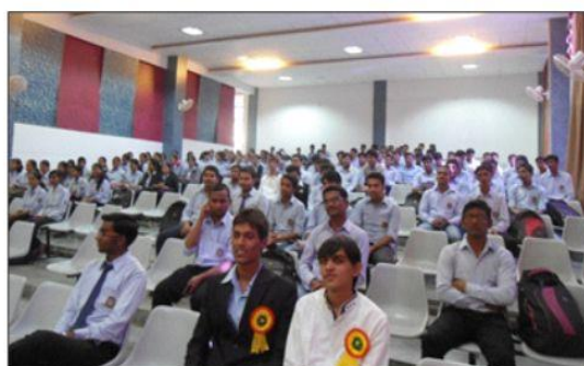
Students presents for Event