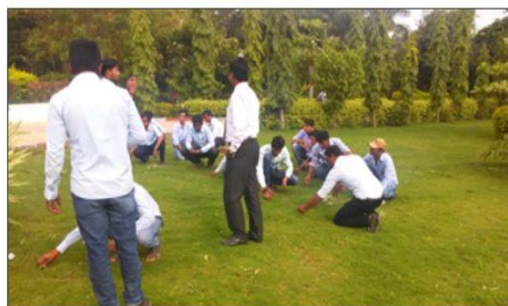
Cleaning of College campus by NSS Students