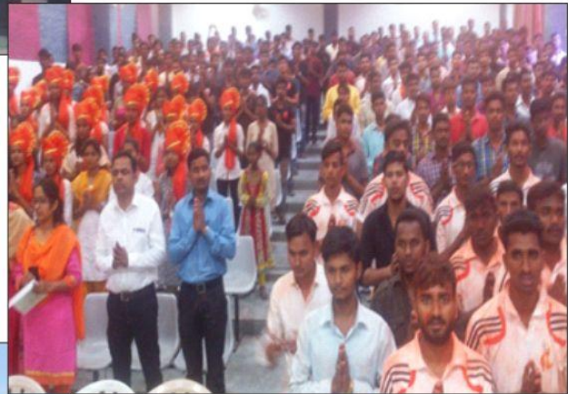
Students presents for Event