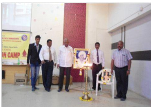
Inauguration of the Blood donation camp by Hon.Shri .Vasantrao Kapare Saheb, Dr.P.M.Gaikwad, Dr.H.N.Kudal,Dr.K.B.Kale