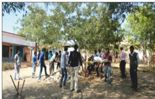
Cleaning of Panchayat school during the camp by NSS students