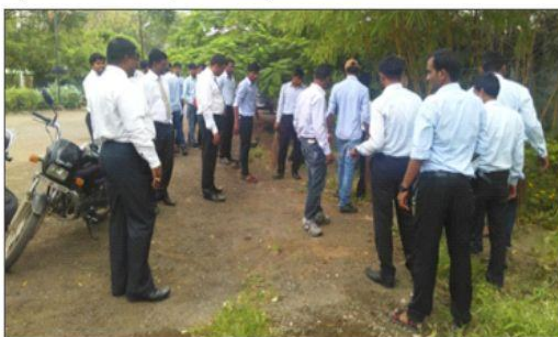
Cleaning of College campus by NSS Students