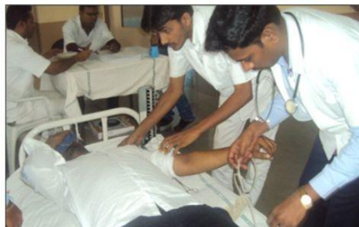
Students donating blood during the camp