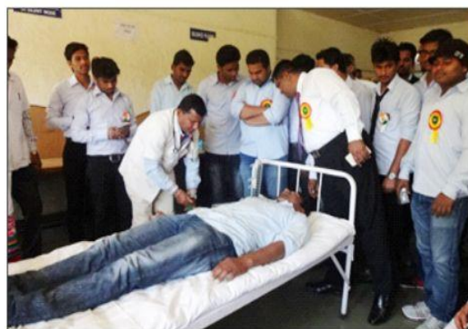
Students donate the blood