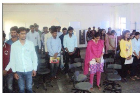
Two minutes silence