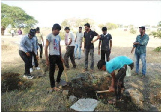
Plantation of tree by student of NSS at manjarsumba village