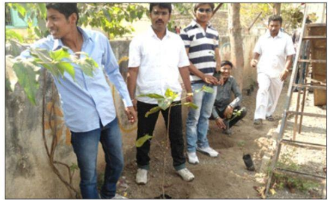
Tree plantation at Jakhangaoon by students