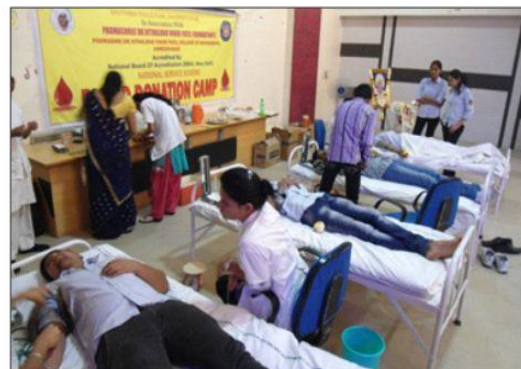
Student doing the blood donation