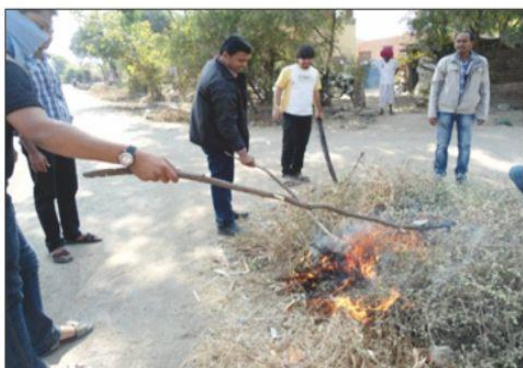
Cleaning and removal of garbage in villages