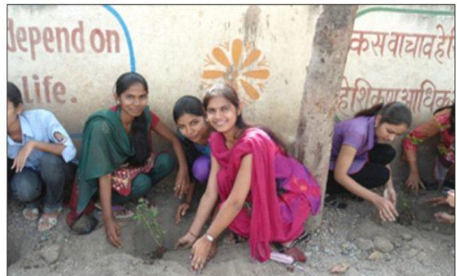
Tree plantation at Jakhangaoon by students