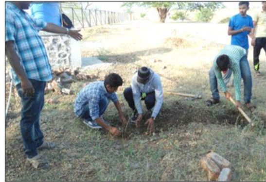
Plantation of tree by student of NSS at manjarsumba village