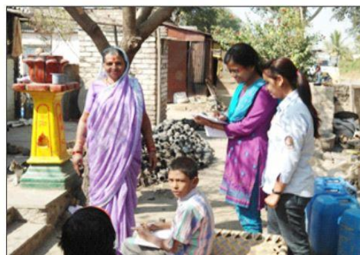
Giving information regarding women welfare