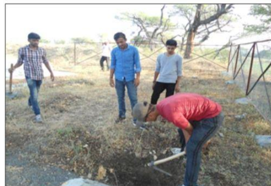
Plantation of tree by student of NSS at manjarsumba village