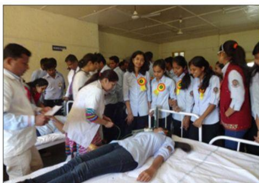
Students donate the blood