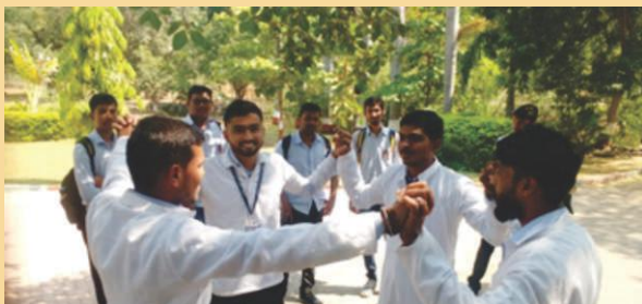
Street Play by Students on occasion of Gandhi Jayanti Week

Event – “150 th Gandhi Jayanti Week” “Gandhi Jayanti Week was celebrated in our college by spreading awareness of cleanliness, tree plantation, Street act, Guest Lecture etc