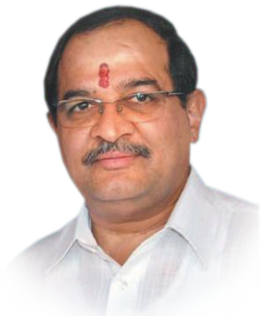
Hon'ble Shri. Radhakrishna Vikhe Patil Leader of Opposition, Maharashtra Legislative Assembly Government of Maharashtra