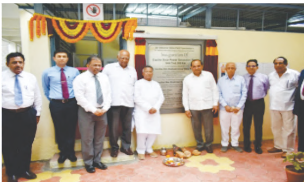
Inauguration of Solar power generation plant by Hon'ble Radhakrishna Vikhe Patil, Leader of opposition Maharashtra Legislative Assembly and Chairman Dr.Vithalrao Vikhe Patil Foundation, Ahmednagar.