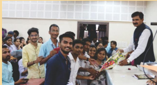
College Team won third prize in Group Indian Song in SPPU Youth Festival-2018 at University Level

Event – “150 th Gandhi Jayanti Week” “Gandhi Jayanti Week was celebrated in our college by spreading awareness of cleanliness, tree plantation, Street act, Guest Lecture etc