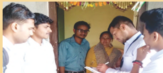
Cleanliness Awareness in society by Students on occasion of Gandhi Jayanti Week

Event - “Akshar Karandak-2018” Our students participated in State Level One act Play “Akshar Karandak-2018” Competitions held at Mauli Sabhagraha, Ahmednagar on 18 Dec 2018.