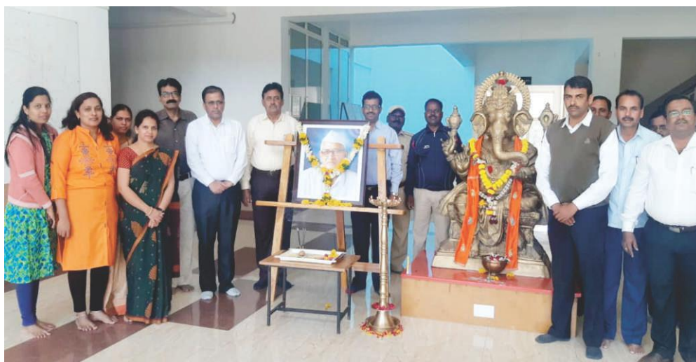
Second Remembrance day of Hon'ble Balasaheb Vikhe Patil (Padmabhushan Awardee)