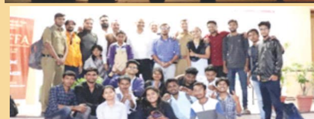
Moments of Marathi One act Play “Suryodayapurvich”