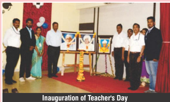
Inauguration of Teacher's Day