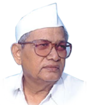
Hon'ble Late. Balasaheb Vikhe Patil Ex. Cabinet Minister for Heavy Industries, Government of India