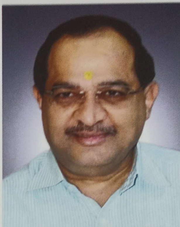
Hon'ble Shri. Radhakrishna Vikhe Patil

Hon'ble Ex Member of Parliament & Union Minister for Heavy Industries & Public Enterprises Founder - Padmashree Dr. Vithalrao Vikhe Patil Foundation, Ahmednagar