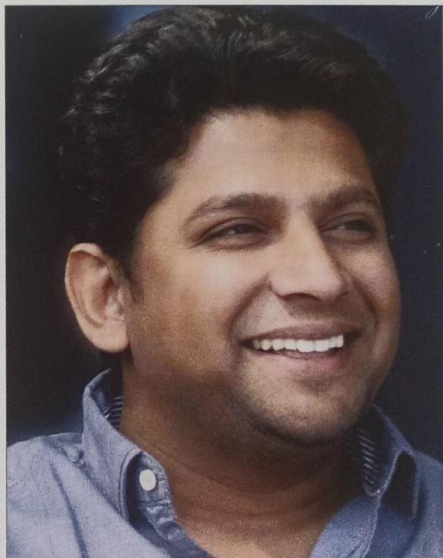
Hon'ble Dr. Sujay Vikhe Patil

CEO, Padmashree Dr. Vithalrao Vikhe Patil Foundation, Ahmednagar.