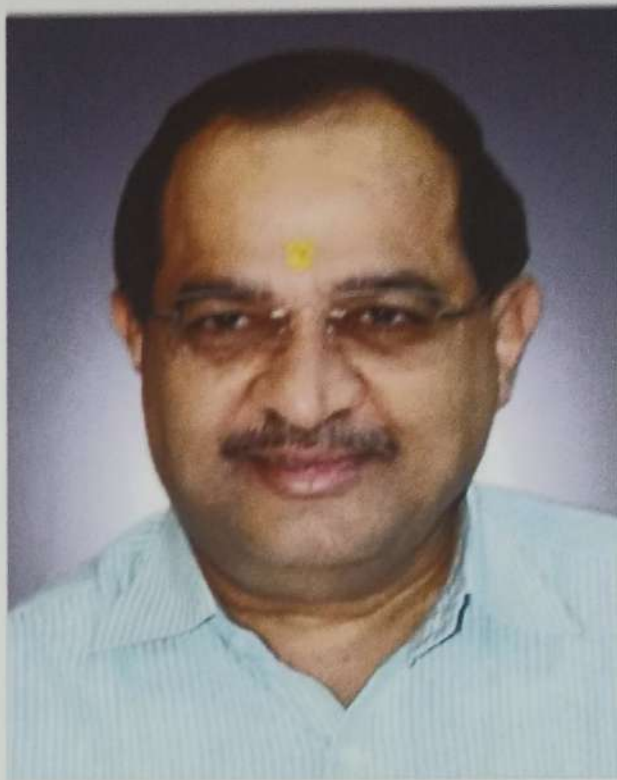
Hon'ble Shri. Radhakrishna Vikhe Patil

Hon'ble Ex Member of Parliament & Union Minister for Heavy Industries & Public Enterprises Founder - Padmashree Dr. Vithalrao Vikhe Patil Foundation, Ahmednagar