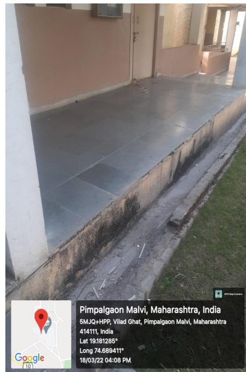
Rain water Gutters