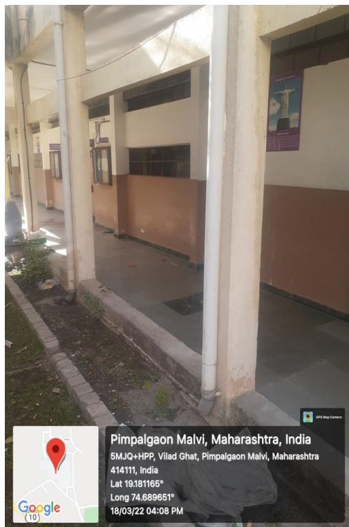
Rain water Pipes