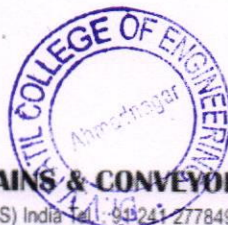
PRINCIPAL Dr. Vithalrao Vikhe Patil College of Engineering Ahmednagar

TECHNOTRAK CHAINS & CONVEYOR SYSTEMS (P) LTD