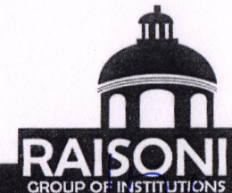
GHRCEM, Ahmednagar Principal

• Engineering • Management • Law • School • Other course