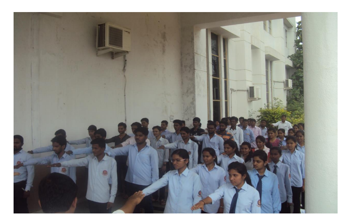
Oath on National unity day 31<sup>ST</sup> OCT 2019