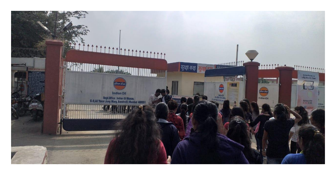
Visit to Indian oil Akolner