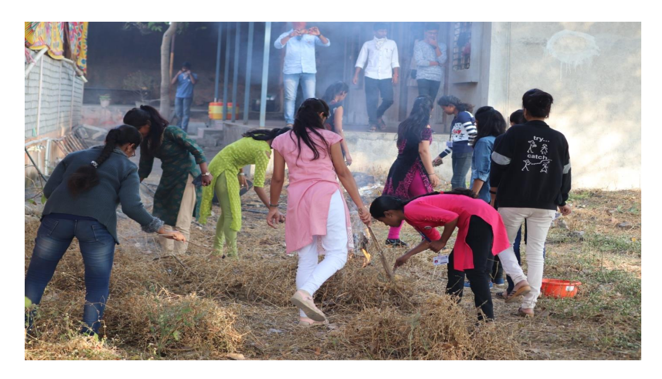
Swacchata Abhiyan at temple