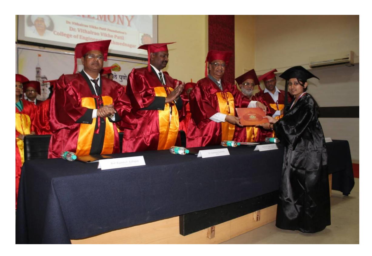
Engineering degree distribution