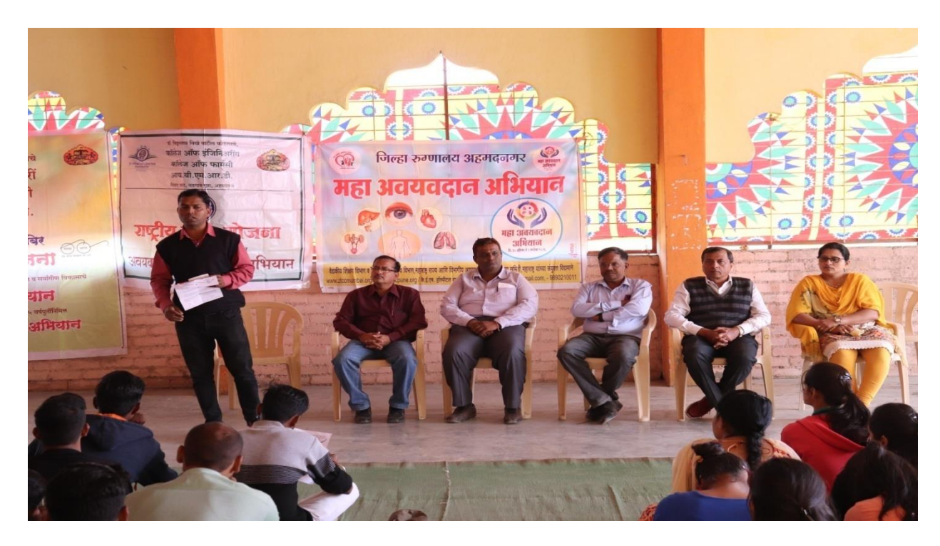
Awareness regarding organ donation