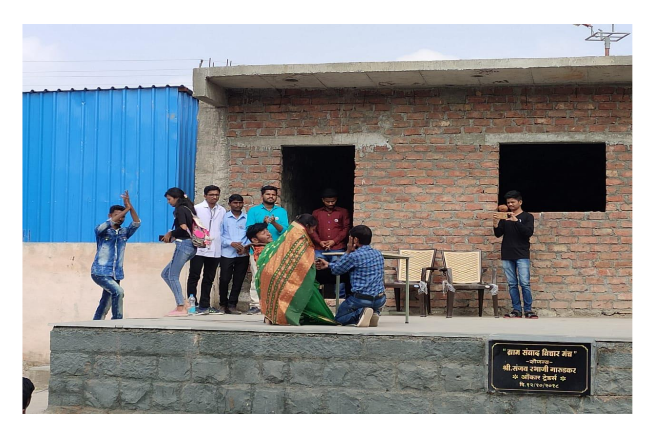
Drama on farmer's suicides