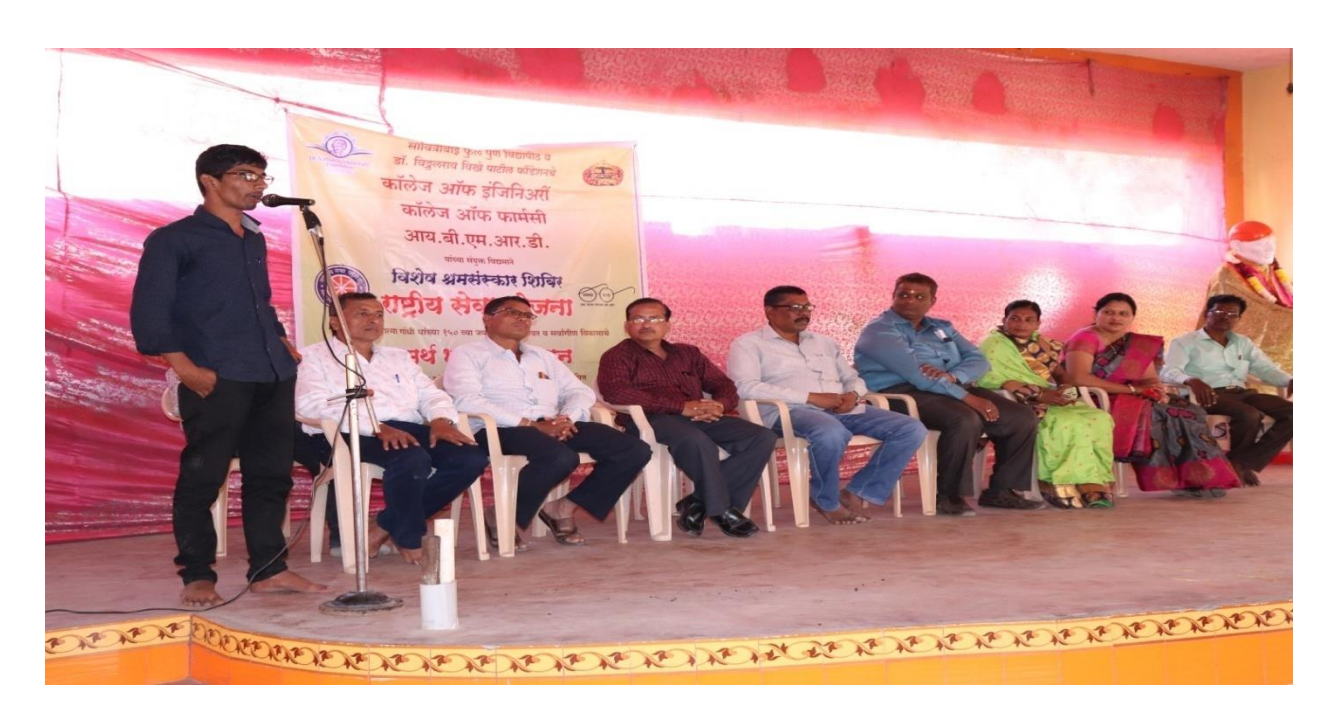
Experience of students about camp