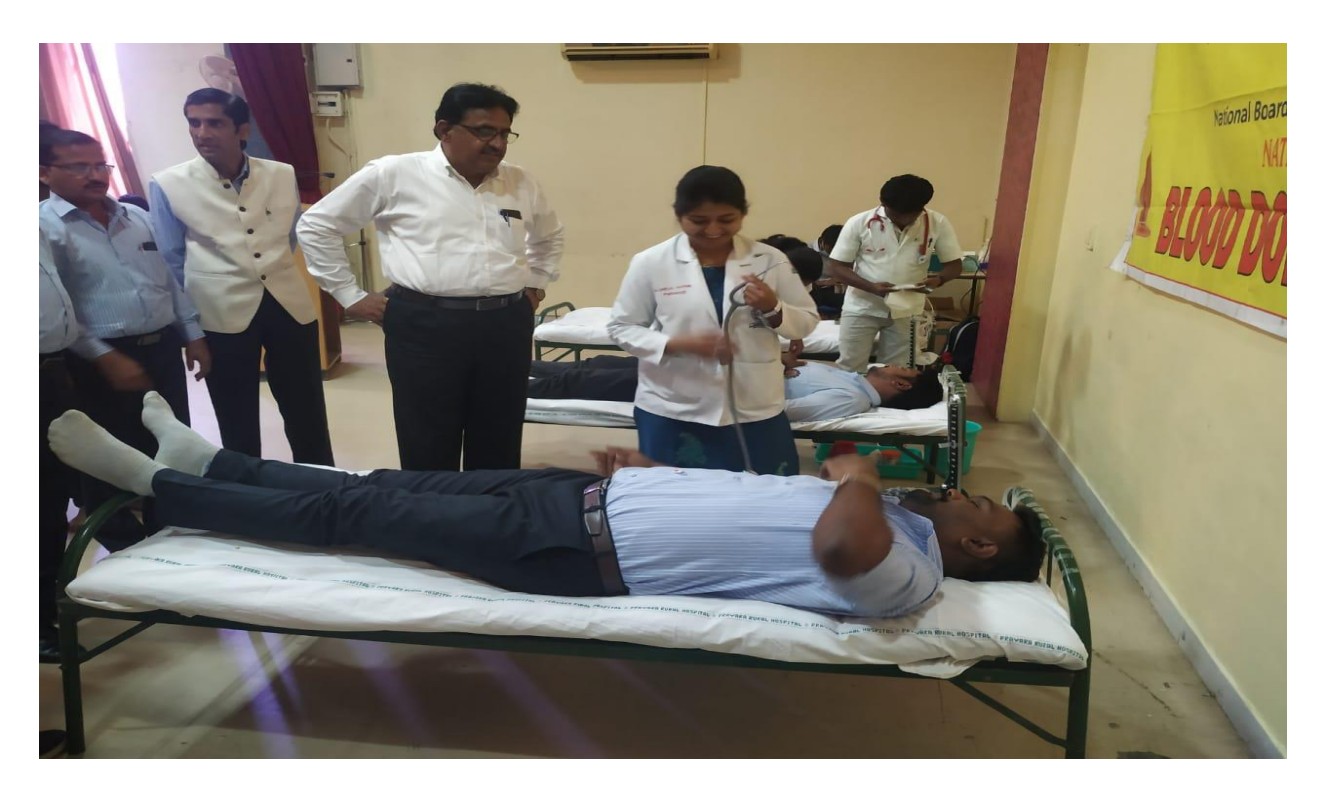
NSS WINTER CAMP AT AKOLNER 9^{\text{TH}} JAN TO 15^{\text{TH}} JAN 2020