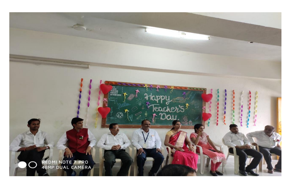
Teacher's Day celebration 5<sup>TH</sup> SEP 2019