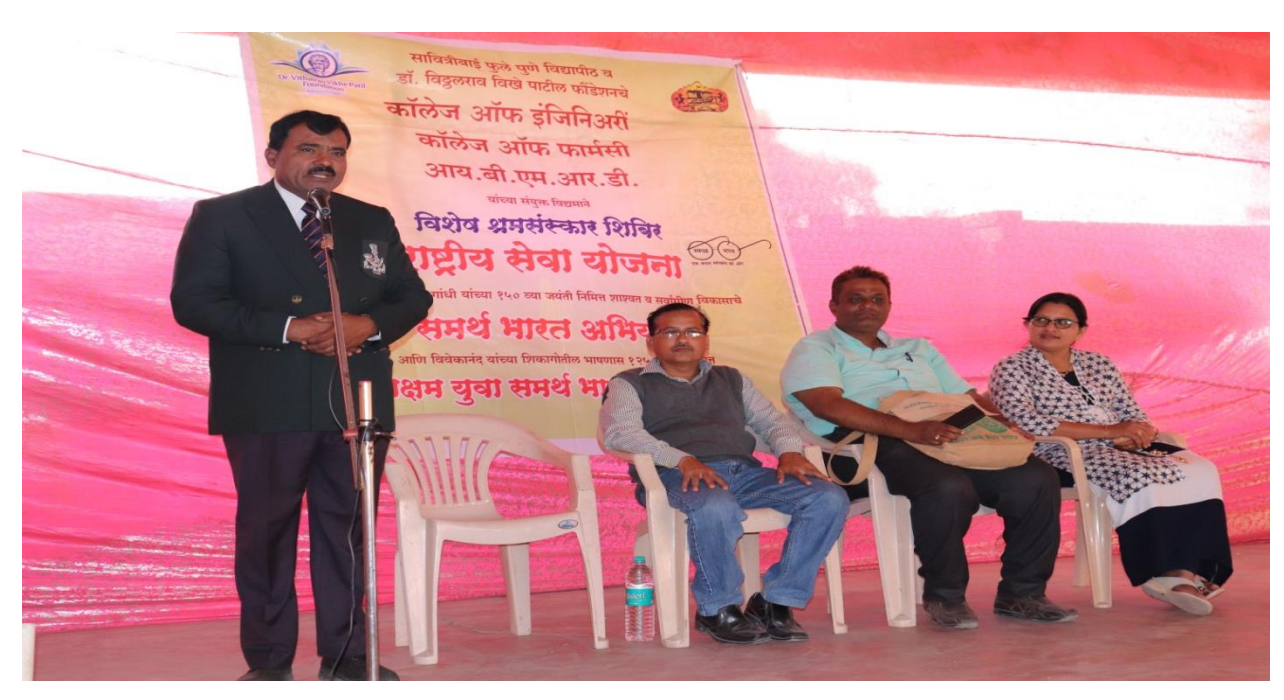
Expert lecture by Retired major