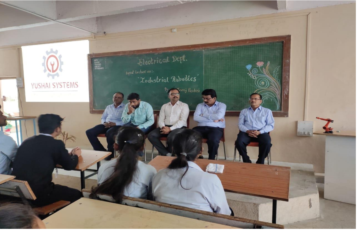
Expert lecture on Industrial robotics 10<sup>th</sup> FEB 2020