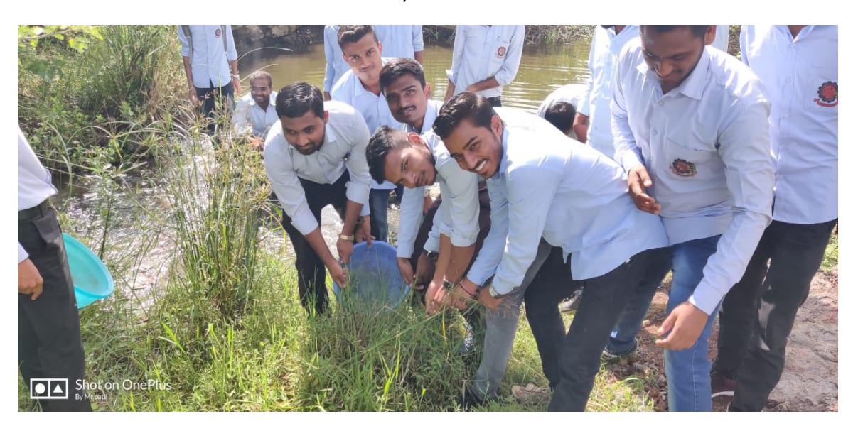
Jal swachhata abhiyan 24^{\text{TH}} SEP 2019