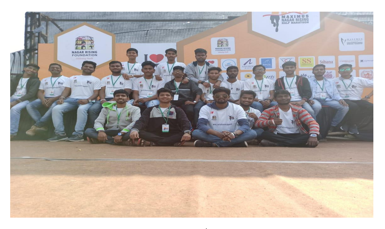
Marathon Rally 2<sup>nd</sup> feb 2020