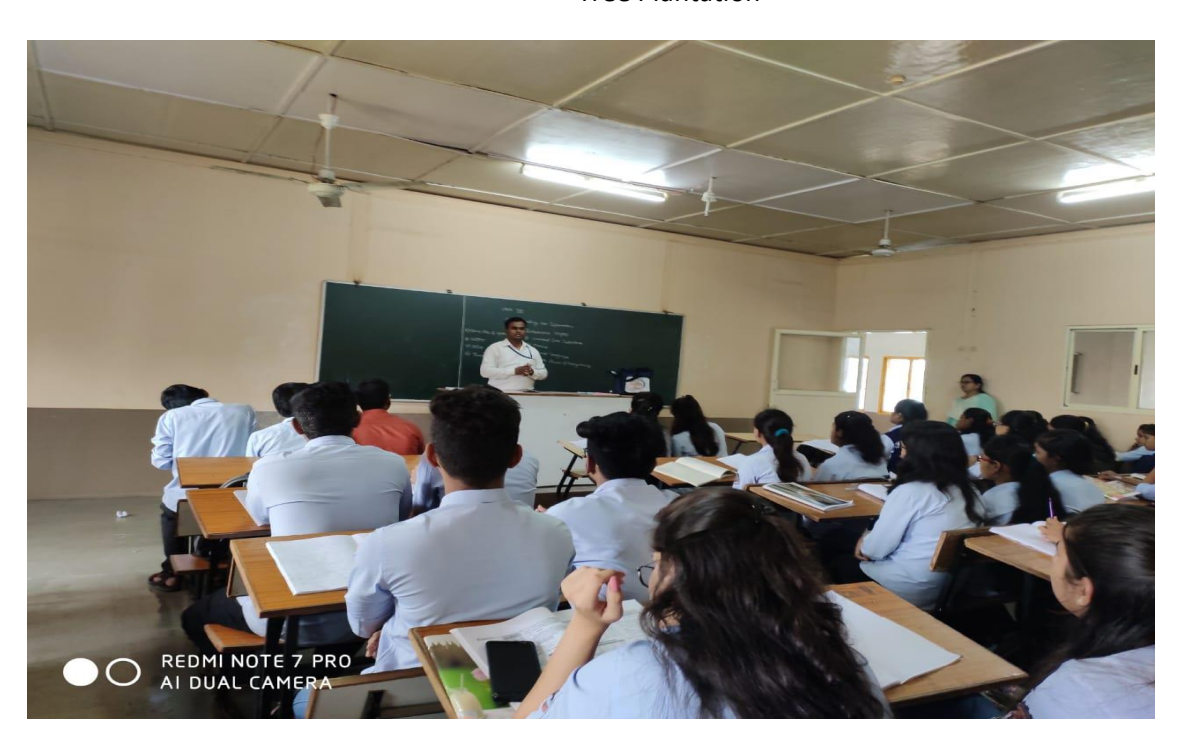
Uva Mahiti dut Abhiyan 5^{TH} TO 7^{TH} JULY 2019