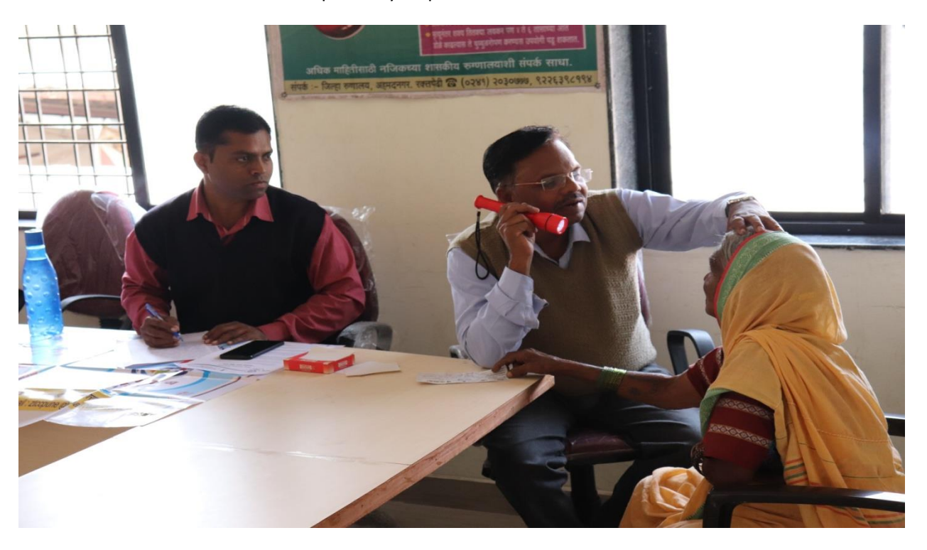
Eye checkup camp